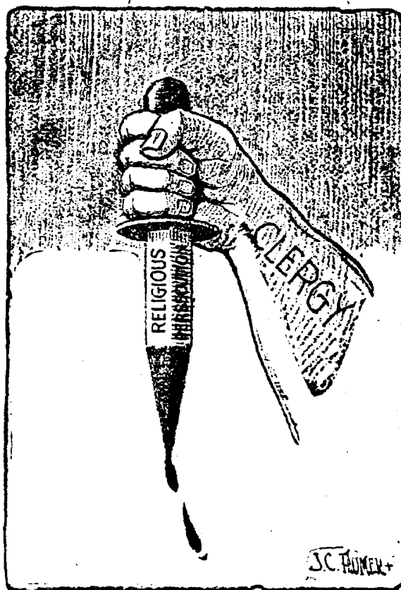
—From The New Era Enterprise.