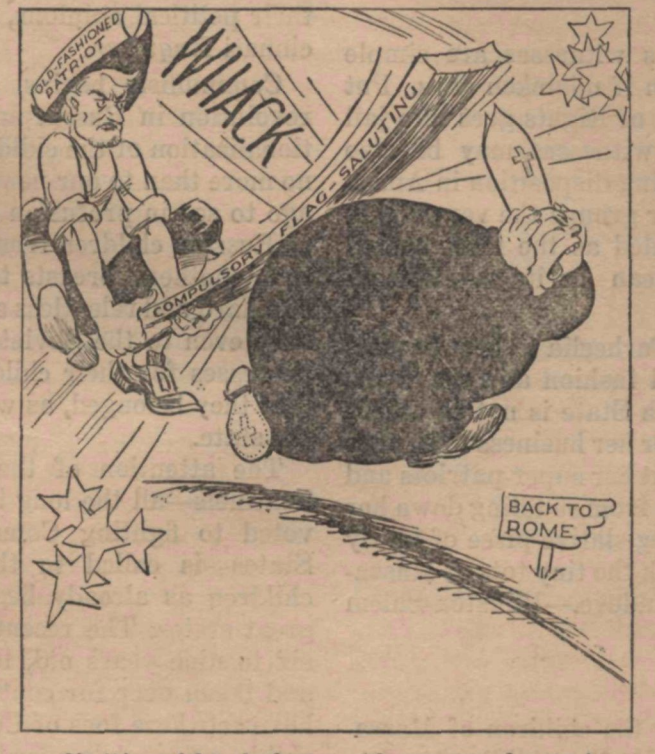
Oh, it's awful to be beaten with your own doorstep!