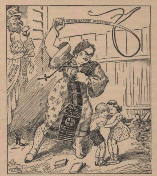
"Massachusetts-there she stands"

The salute law echoes the spirit of the teacher's oath bill. It expresses an impatient, self-