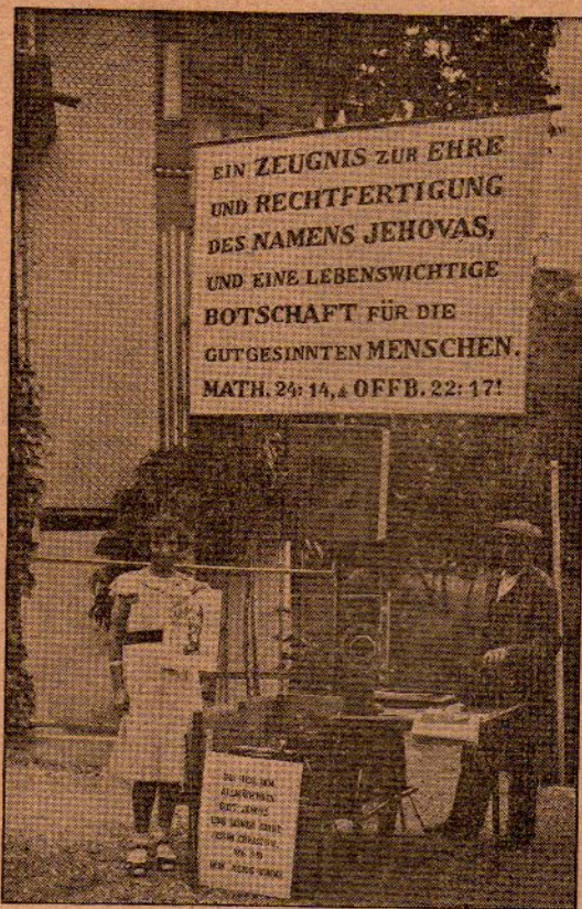
Jehovah's Kingdom publishers in Switzerland, witnessing with transcription machine mounted on bicycle

◆ Scene in Glasgow, September 11. Troop of Jehovah's witnesses proceeding down Argyle street bearing banners "Religion is a snare and a racket". Parade accidentally breaks in half. Out from a side street, into Argyle street,