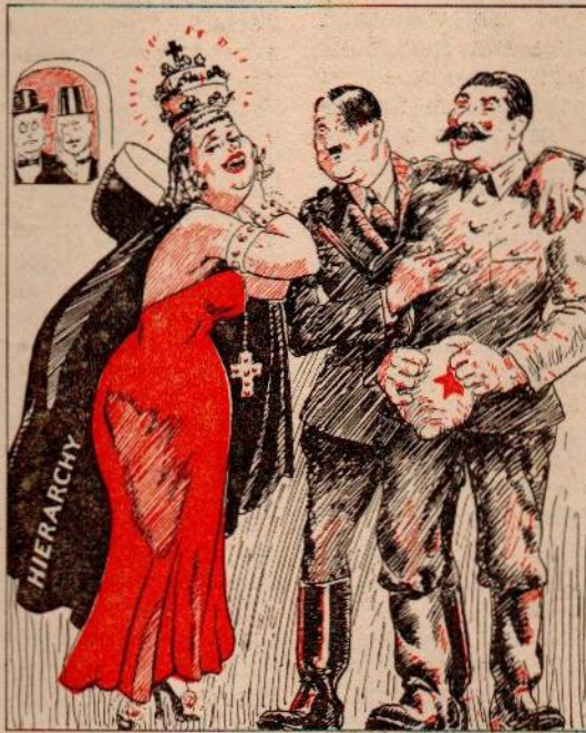
A crown-jewel-collector from the Kremlin meets a new prospect

This demonization of a man and a whole nation is not contradictory to Papal policy, as history can show a continued labor of diabolical conspiracies, murders, inquisitions and betrayals down through the centuries on the part of the Papacy. That Hitler believes he is a Messiah is characteristic of the Catholic doctrine of the "divine right of kings". It might be recalled that the Jesuits so corrupted Louis XIV in this respect that he considered as his due