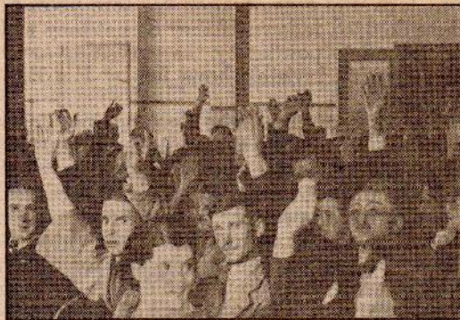
At Montreal Kingdom Hall, answering the question "How many ex-Catholics are in the audience?" —A 90-percent showing of hands

Now, a month since the trial, only one of the seventy-odd newspapers of the United States which blared forth evil and false reports about the Lord's servants has carried an account of