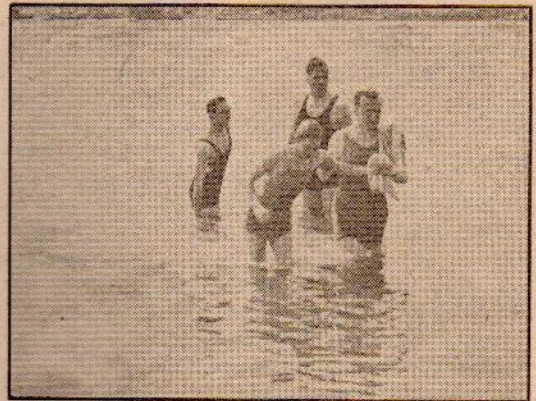
Immersion scene at Montreal, Quebec