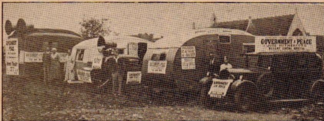
Trailer camp at Bristol, England

false witness, as denounced in the Bible book of Deuteronomy. In New York city the so-called "Coughlinites", according to circumstantial evidence set forth in many publications, have definitely been using this technique on Jews for several months past. A refinement of the same system was planned for Madison Square Garden. Witnesses at the trial of the three ushers above mentioned plainly presented the facts to the court, that a group of several hundred Coughlinites walked from radio station WMCA, after they had finished picketing that station for refusing to broadcast Coughlin's speeches, and entered the Garden, all seating themselves in the rear top balcony, just behind the speaker's platform.