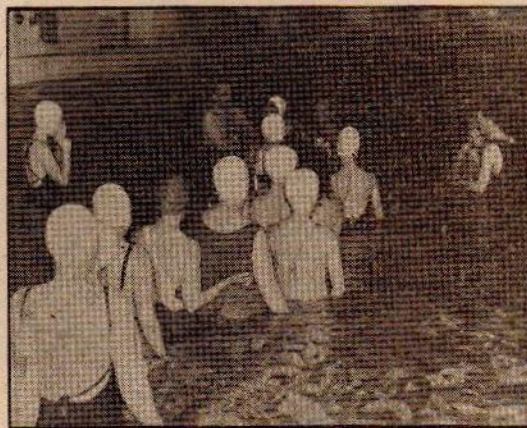
Immersion of Jehovah's witnesses at Los Angeles, California

Such is the most villainous sort of bearing