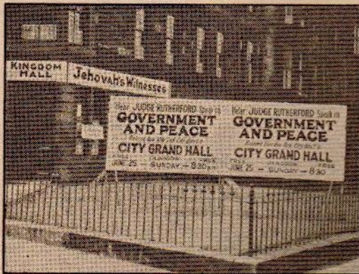
Jehovah's Kingdom Hall, Glasgow

The time of those who fight against Jehovah God is becoming shorter and shorter. The Devil and his hordes know that they have but a little while to carry on their wickedness. They strive desperately to turn every person against God. These demons enter into individuals, possess their minds, and force such willing subjects to do their bidding. Even in the courtroom, when the complaining witnesses (Coughlinites) began to see that the case was going against them, several hollered out, "Lies," another emitted a superstitious oath, whereupon they were ejected by the Court attendant. These people were obviously possessed by evil forces.